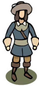
PAUL DE CHOMEY DE MAISONNEUVE