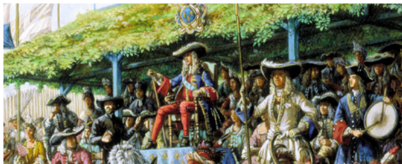
Louis-Hector de Callière (1648 - 1703)