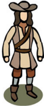
COUREUR DES BOIS