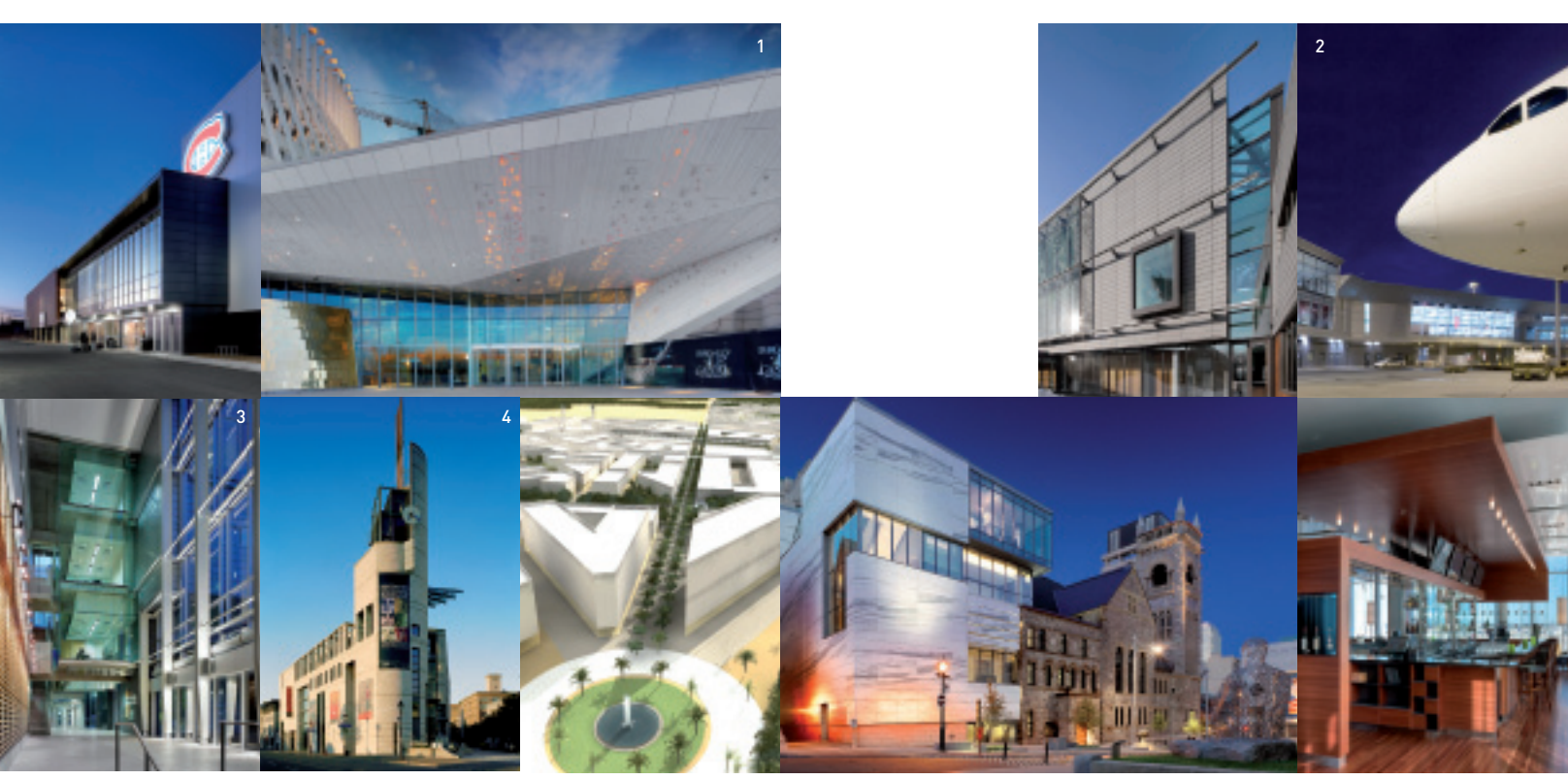
PARTENAIRES: 1. MSDL / 2. PCJA / 3. DIAMOND AND SCHMITT ARCHITECTS / 4. DAN S. HANGANU ARCHITECTES.